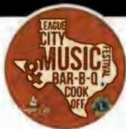
Exhibit A "Event"

Agreement No. _____ District # _____ Code Chart 64 # _____ Project: _____