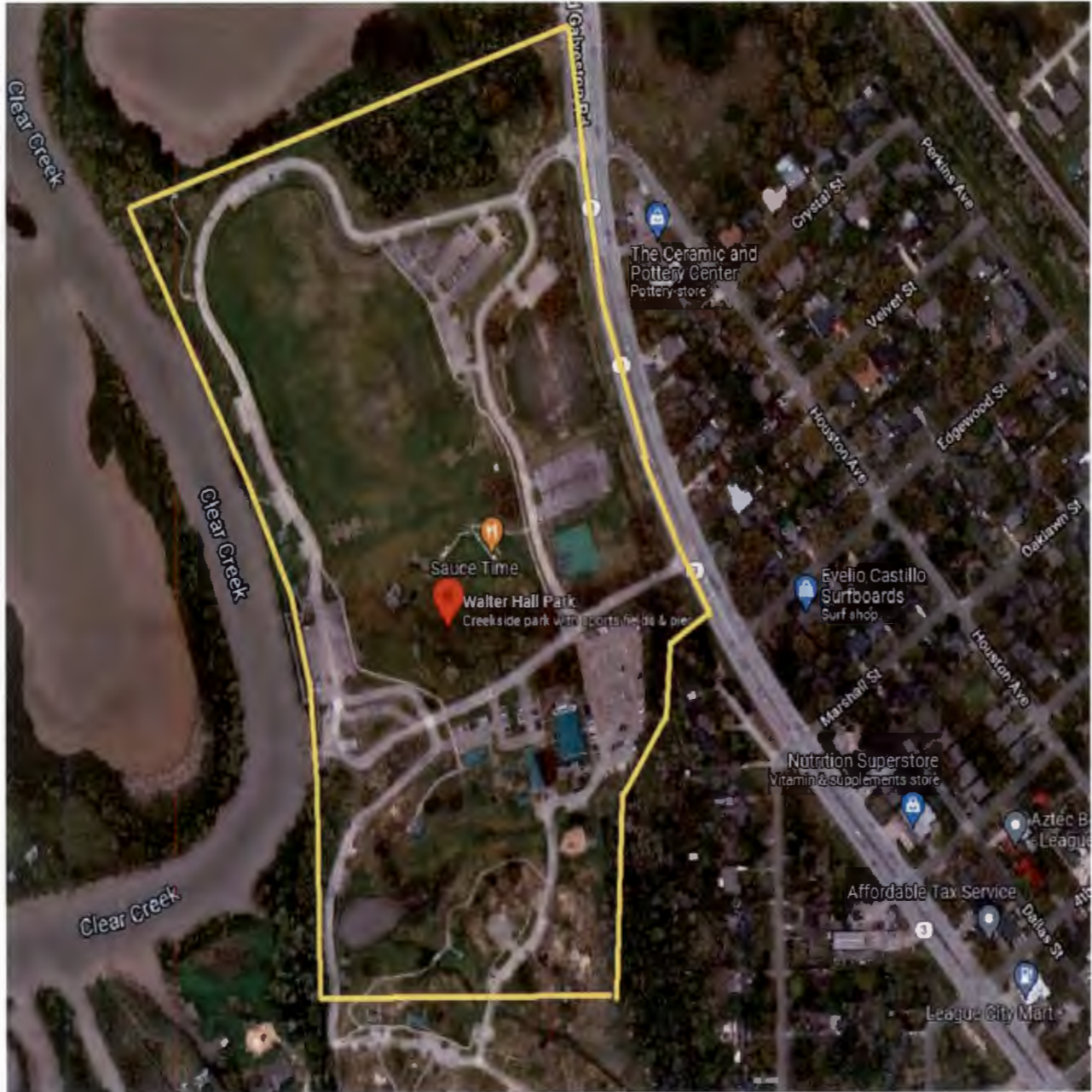
Exhibit C LOCATION MAP

Agreement No. _____ District # _____ Code Chart 64 # _____ Project: _____