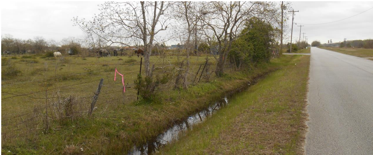
View toward the site facing southeast down Dickinson Ave.