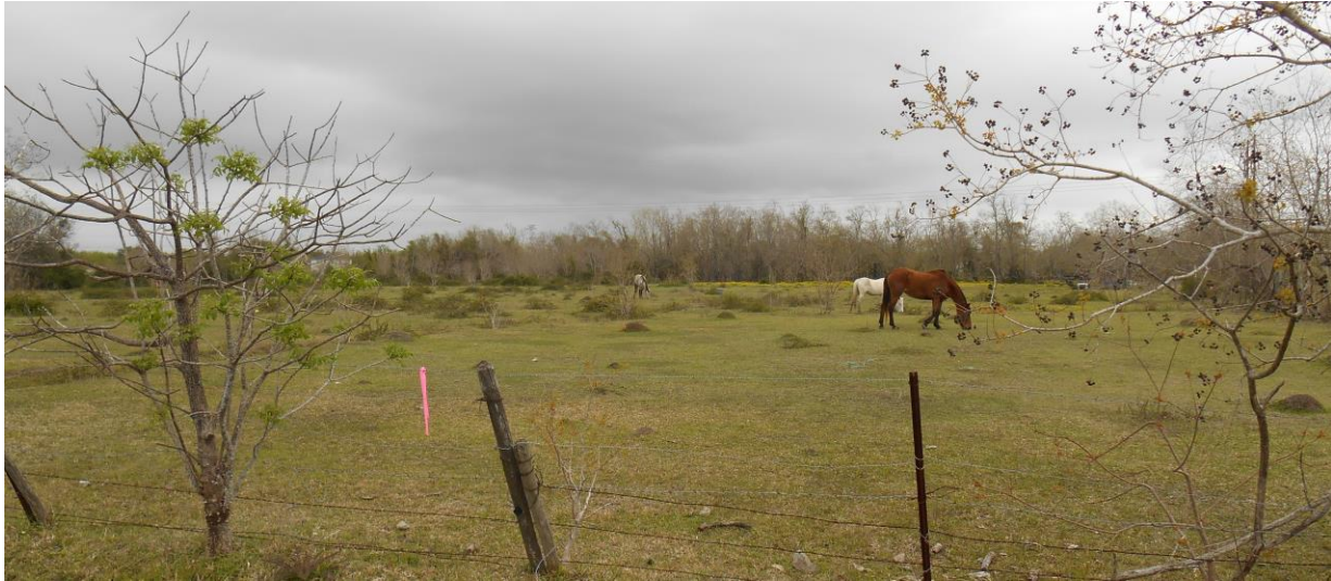
View of the site from Dickinson Ave. facing northeast