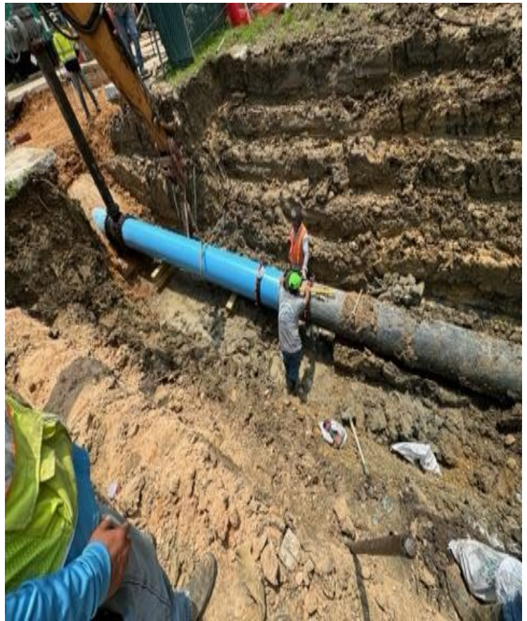
20" Force Main