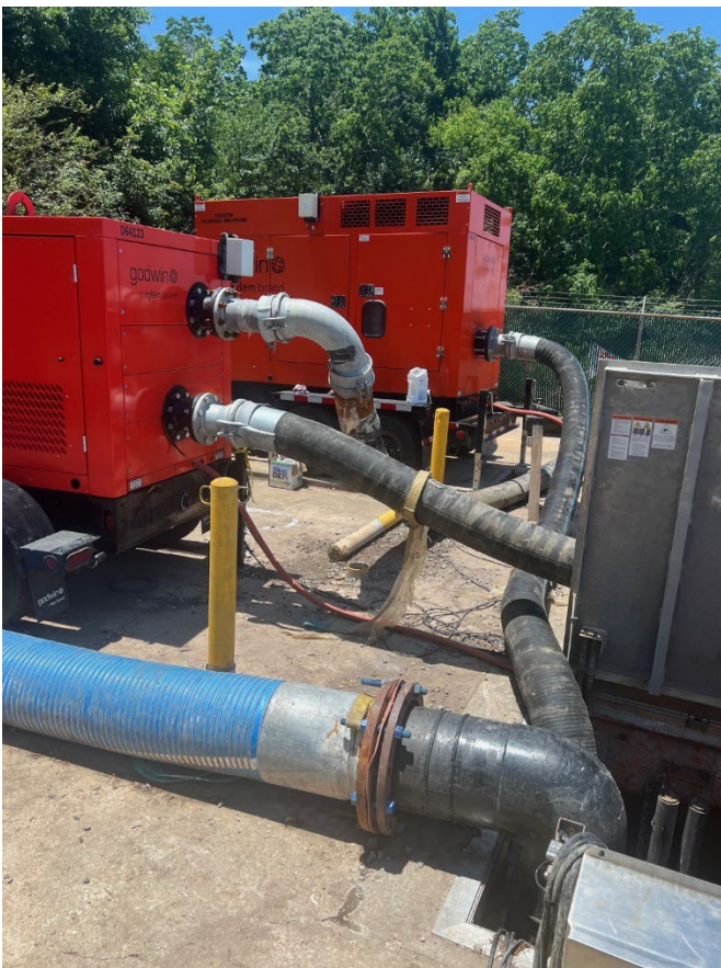
Lift Station Wet Well By-Pass