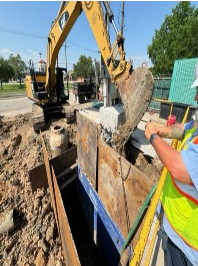
18 ft Deep Gravity Sewer Excavation