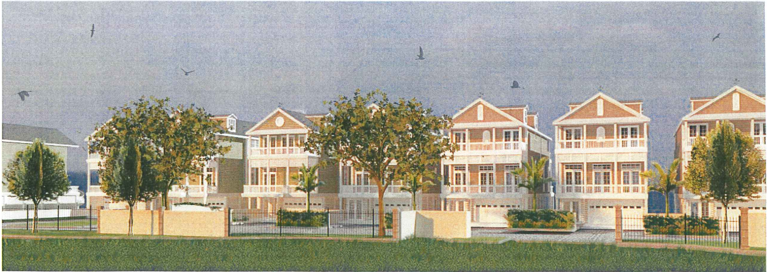
MARINA WAY RESIDENTIAL MARINA WAY DRIVE, LEAGUE CITY, TX