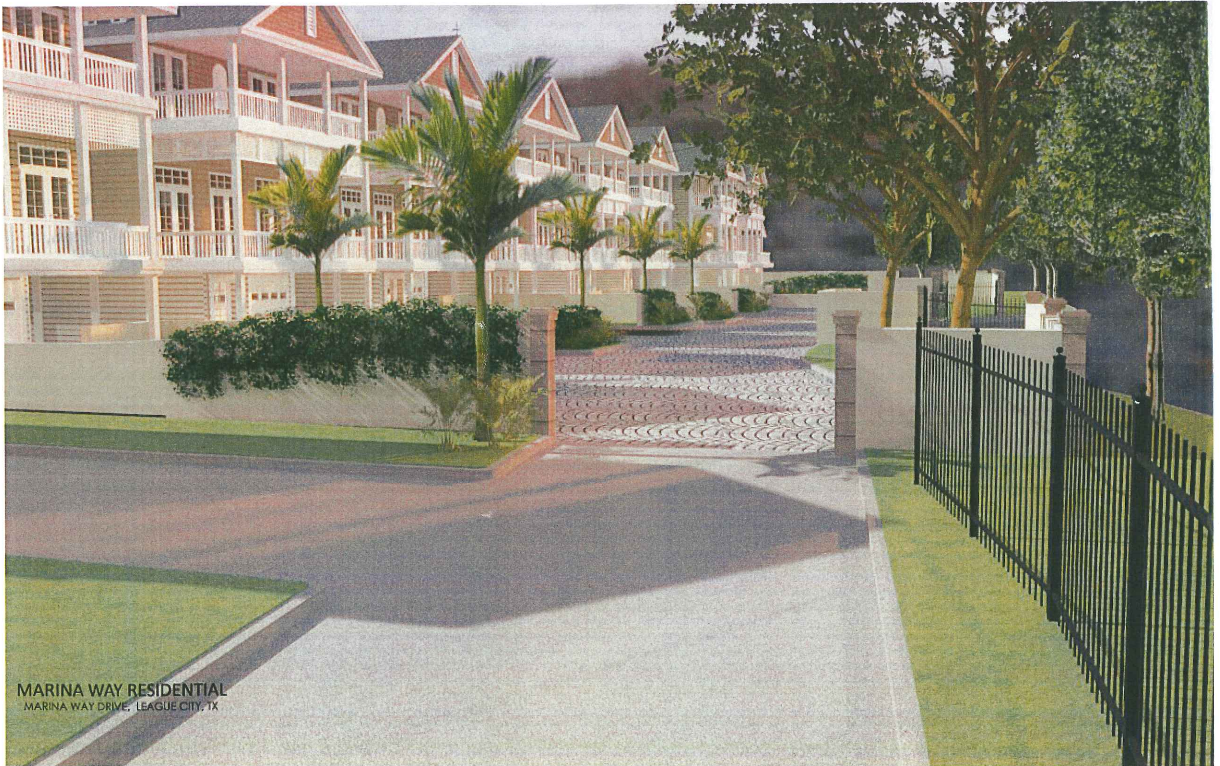
MARINA WAY RESIDENTIAL MARINA WAY DRIVE, LEAGUE CITY, TX