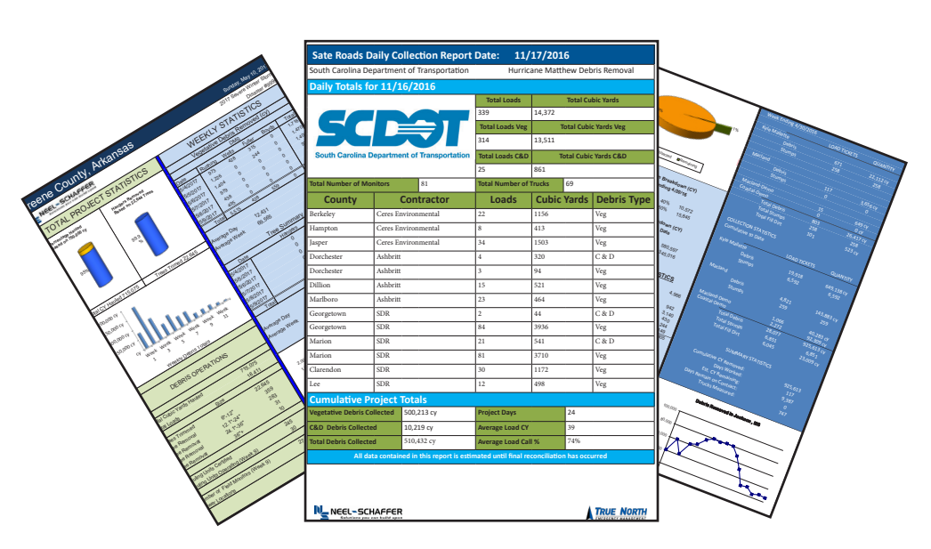
True North recognizes that our clients have different needs and we provide the ability to customize reports to fit their reporting needs.

Daily Operational Reports: True North will provide detailed daily status reports. These developed reports will be automated generation for our comprehensive data management system. Relevant project statistics and cumulative statistics will be shown in a straight forward graphical manner for officials to provide information to the media or to their constituents. These reports will be customized to fit the specific needs of the City, and will also include information such as number of vehicles operating, total loads hauled,