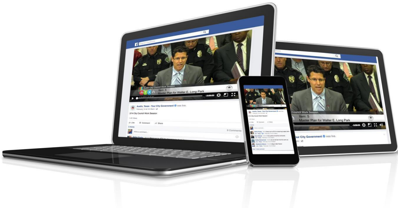
PSA Example: Veterans Day

Streaming to social media live platforms can immediately expand your audience and increase distribution channels. For example, Facebook engages your viewers by sending a notification alert to your followers before the stream begins. Residents can then easily connect, interact and follow your event in real time.