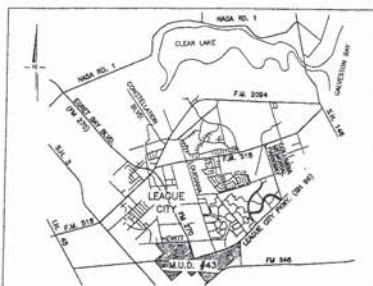
VICINITY MAP SCALE: 1" = 1/2 MILE

We, the undersigned Members of the Board of Directors of Galveston County Municipal Utility District No. 44 of Galveston County, Texas, do hereby certify that this map is a complete and accurate map showing the boundaries of said district.